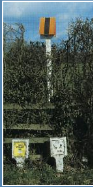
Esso & MLP aerial marker