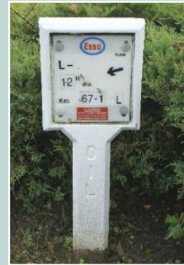
Esso marker posts