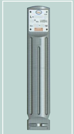
New design marker post

Studs such as these may be found in footpaths and car parks etc.