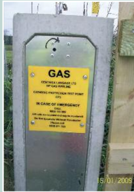
Centrica marker post