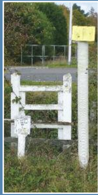
GPSS aerial marker