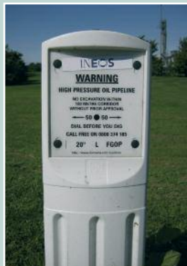
Ineos marker post