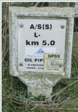
GPSS marker post