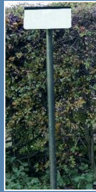
Wingas aerial marker