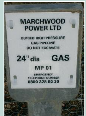
Marchwood Power post