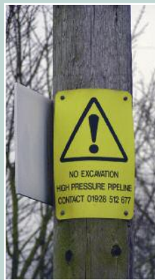
Pole warning marker