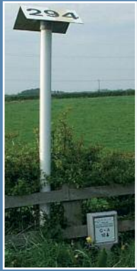
Essar aerial marker