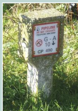
Essar marker post