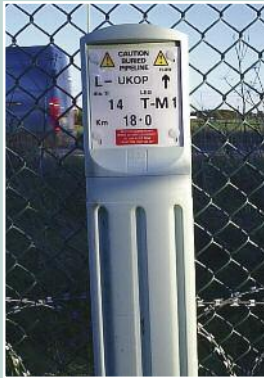
BPA marker post