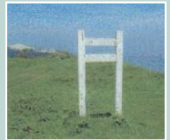
Stile warning marker

You may find signs such as these on apparatus close to the pipeline.