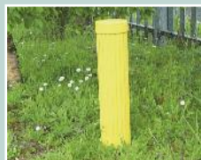
Post warning marker

When the pipeline route has been located it will be marked with location pegs.