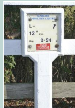
Mainline marker post