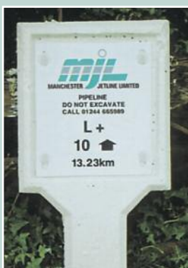
MJL marker post