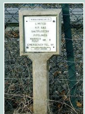
Wingas marker post