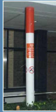
National Grid Gas

Each operator has similar aerial markers to left