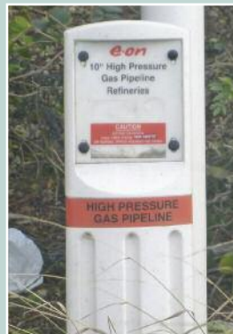
EON marker post