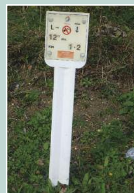
Total marker post