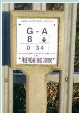
SABIC marker post