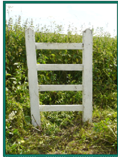
CLH-PS Marker Stile